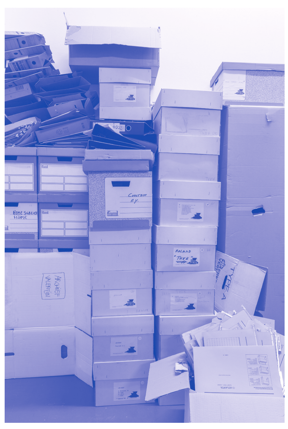
Old Witte de With archival boxes, 2016.